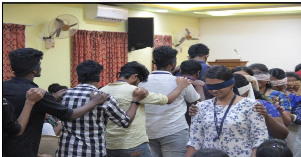
Student Council Members during the Ice breaker session

Newly elected Officer Bearers of the Student Council were given training on Leadership Training Program on 17 th July 2019